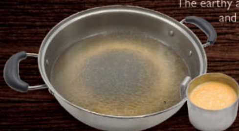
Truffle Cheddar Cheese The earthy aromas of the rare and delectable fungi in the exceptional flavored cheddar