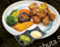
Kurobuta Steak Japanese Style