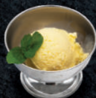
Vanilla Ice Cream