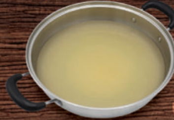
Miso Traditional Miso and Stock Soup