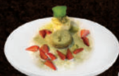
Matcha Lava Cake & Ice Cream