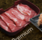
D36 Premium Pork