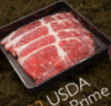
D32 USDA Ribeye Prime