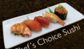
Chef's Choice Sushi