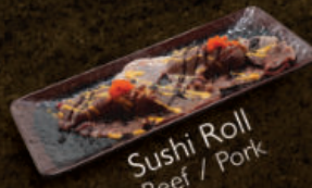
Sushi Roll Beef / Pork