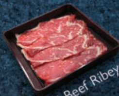
D25 Beef Ribeye