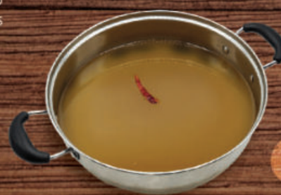
Asian Chim Chum Chicken Soup with galangal, sweet basil, lemongrass, & kaffir lime leave