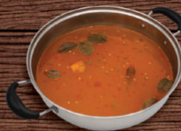
Spicy Tom Yum Garlic, Chili, Lemongrass, Spices and Cilantro