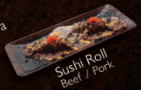
Sushi Roll Beef / Pork