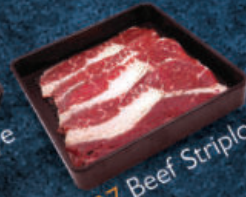
D27 Beef Striploin