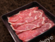
D25 Beef Ribeye