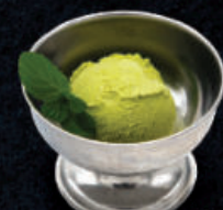
Green Tea Ice Cream