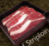
D27 Beef Striploin