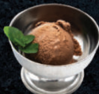
Chocolate Ice Cream