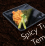
Spicy Tuna Temaki