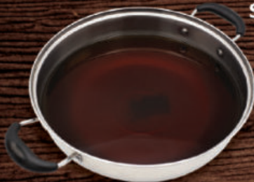
Sukiyaqi Japanese sweet soy sauce and sake