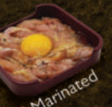
D39 Marinated Chicken