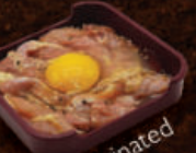
D39 Marinated Chicken