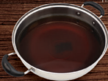
Thai Boat Noodle Soup Thai Style strong flavour soup with soy sauce and spices