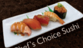
Chef's Choice Sushi