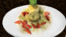
Matcha Lava Cake & Ice Cream