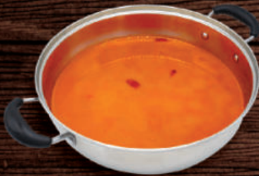
Sichuan Pepper Soup (Ma La Tang) Special spice ingredients create a numbness in the mouth