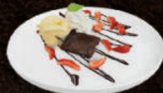
Brownie & Ice Cream