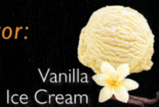
Vanilla Ice Cream