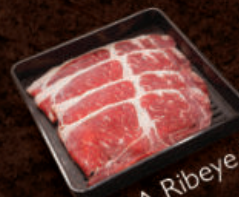
D32 USDA Ribeye Prime