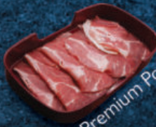
D36 Premium Pork