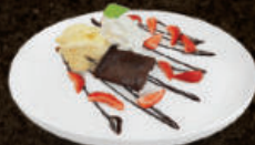
Brownie & Ice Cream