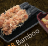
D38 Bamboo Chicken