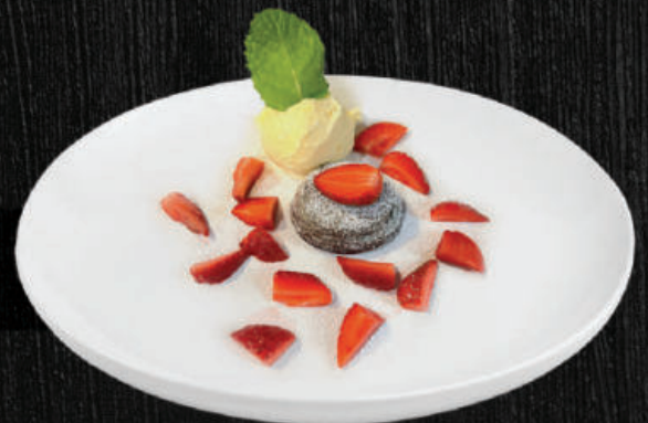
Chocolate Lava Cake & Ice Cream