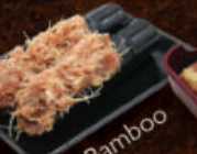
D38 Bamboo Chicken