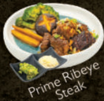
Prime Ribeye Steak