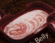
D35 Pork Belly Skinless