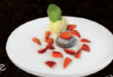
Chocolate Lava Cake & Ice Cream