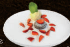
Chocolate Lava Cake & Ice Cream