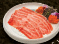
Japanese A5 Wagyu Chuck Ribeye