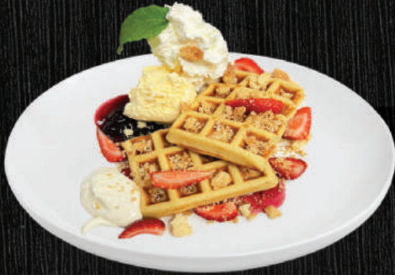
Waffle & Ice Cream

Desserts included in the $35 and $50 plan Please order 15 minutes in advance.