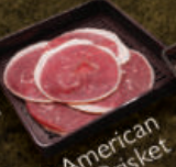
D28 American Wagyu Brisket