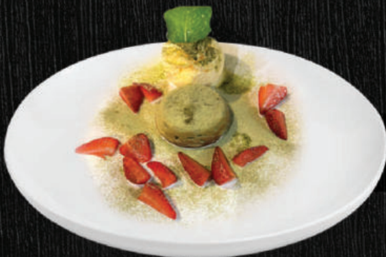
Matcha Lava Cake & Ice Cream