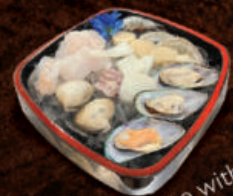
Seafood You may substitute with fish only