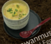
Chawanmushi Steamed Eggs