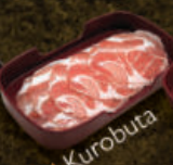
D34 Kurobuta Pork