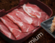
D36 Premium Pork