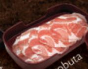
D34 Kurobuta Pork