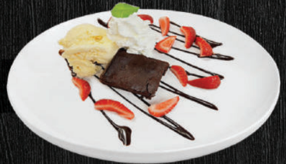
Brownie & Ice Cream