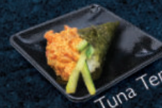
Spicy Tuna Temaki