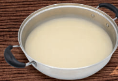
Pork Bone Soup Traditionally simmered bones for 24 hours, very rich and flavorful