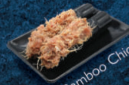
D38 Bamboo Chicken