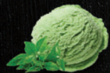
Green Tea Ice Cream