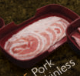
D35 Pork Belly Skinless