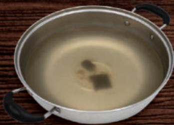
Shabu Shabu Dashi the traditional Japanese dashi kombu

ShaBushi offers 9 signature broths, unique to our restaurant.