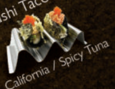
Sushi Taco California / Spicy Tuna