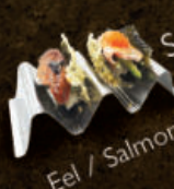
Eel / Salmon