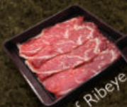
D25 Beef Ribeye