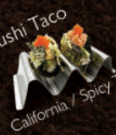
California / Spicy Tuna