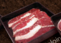
D27 Beef Striploin