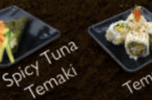
Spicy Tuna Temaki