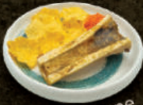
Wagyu Bone Marrow