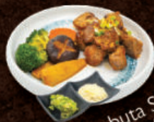
Kurobuta Steak Japanese Style