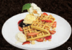
Waffle & Ice Cream