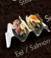
Eel / Salmon