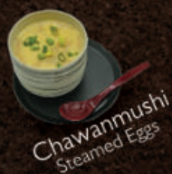
Chawanmushi Steamed Eggs