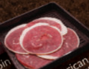
D28 American Wagyu Brisket