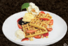
Waffle & Ice Cream