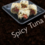
Spicy Tuna Roll