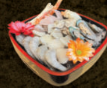
Seafood You may substitute with fish only